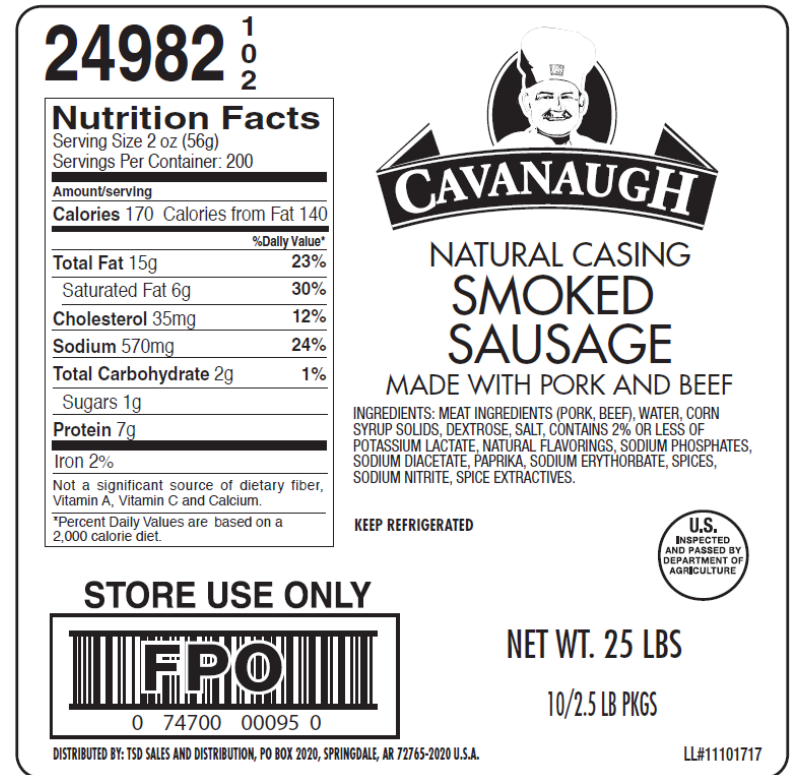
Master Case Label