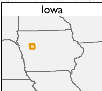
□ Sac 04, 21Jun24