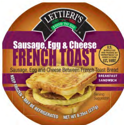
Front of package

MANUFACTURED BY: HEARTHSIDE FOOD SOLUTIONS, SLC, UTAH 84116 COMMENTS: 1-800-527-5509