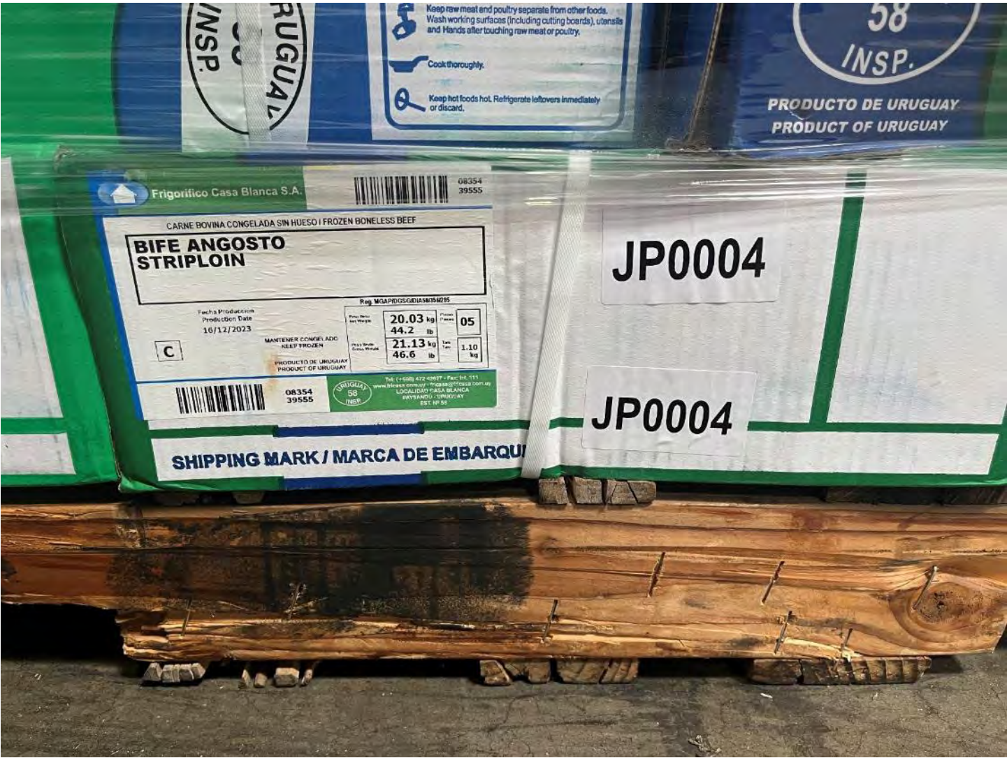
Bife Angosto (Striploin), various production dates, SM#JP0004 located on the right side of the container